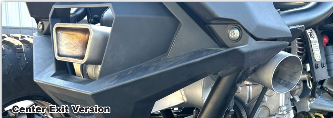
Center Exit Version