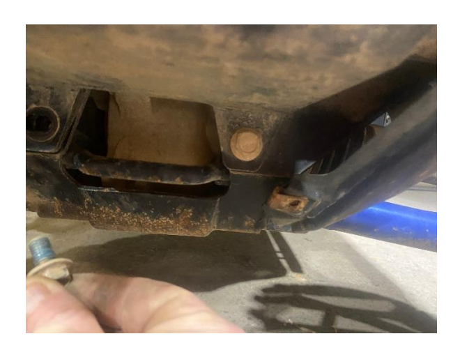
STEP 3: Place the bumper through the upper holes in plastics and let hang.