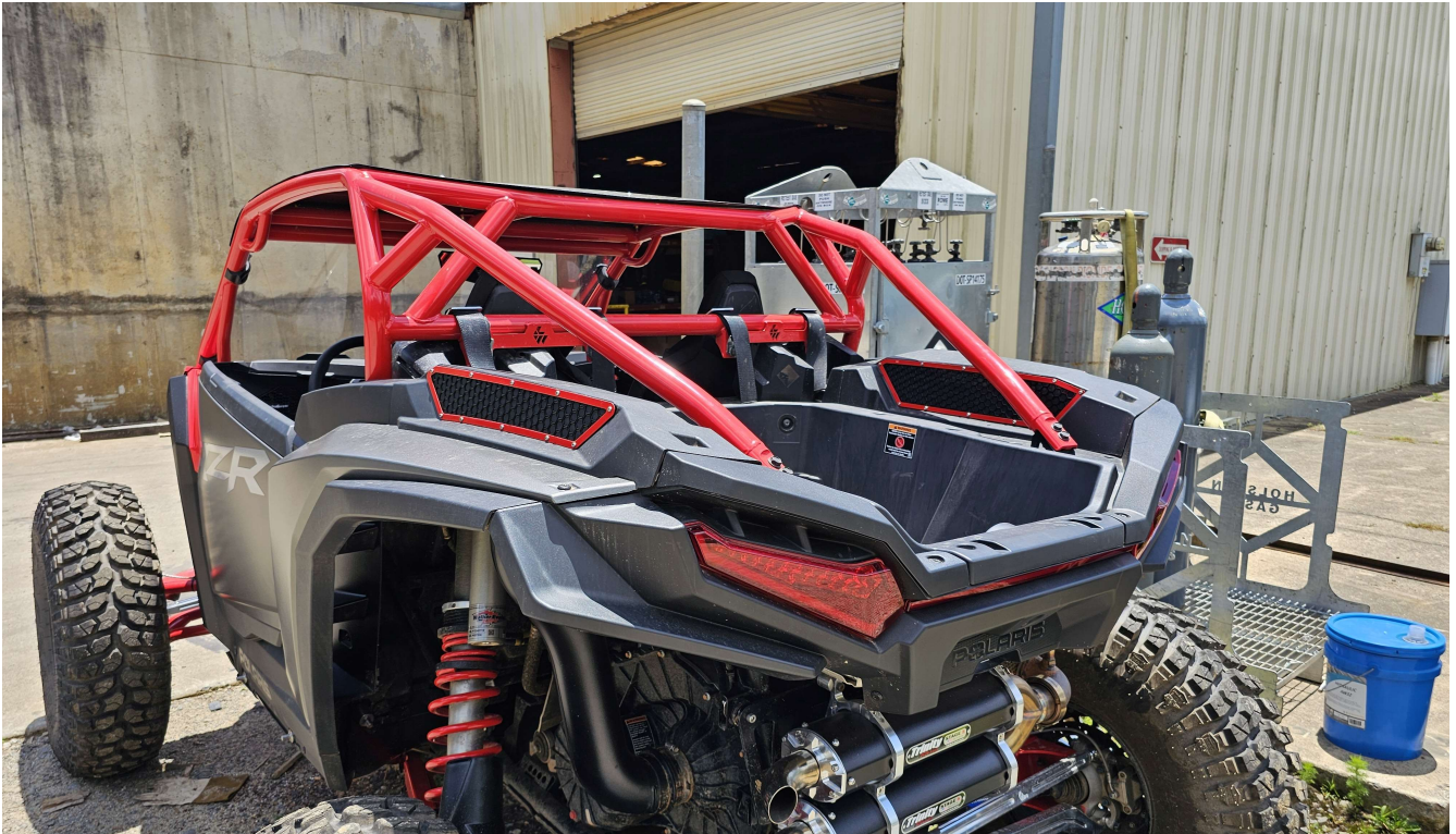
Outside & Inside Vent Cover installed

THANK YOU FOR CHOOSING L&W FAB PRODUCTS!