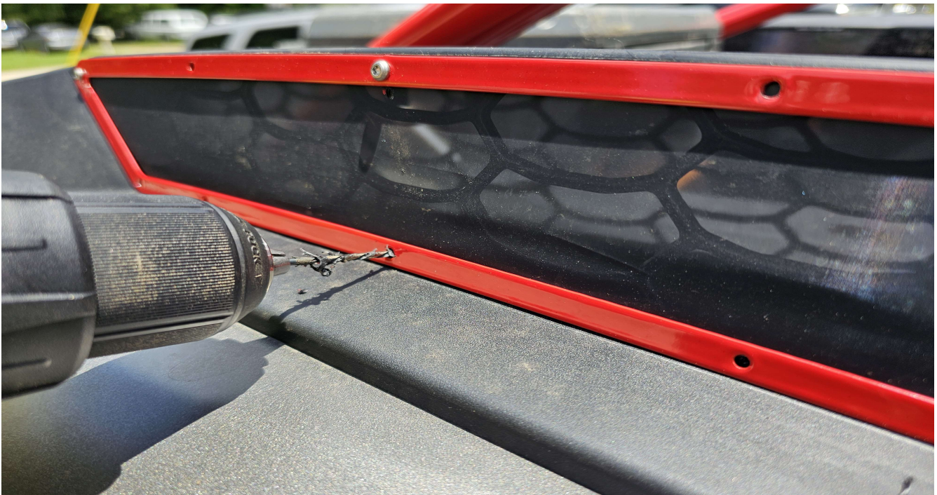
Vent Cover Outline temporarily secured in place