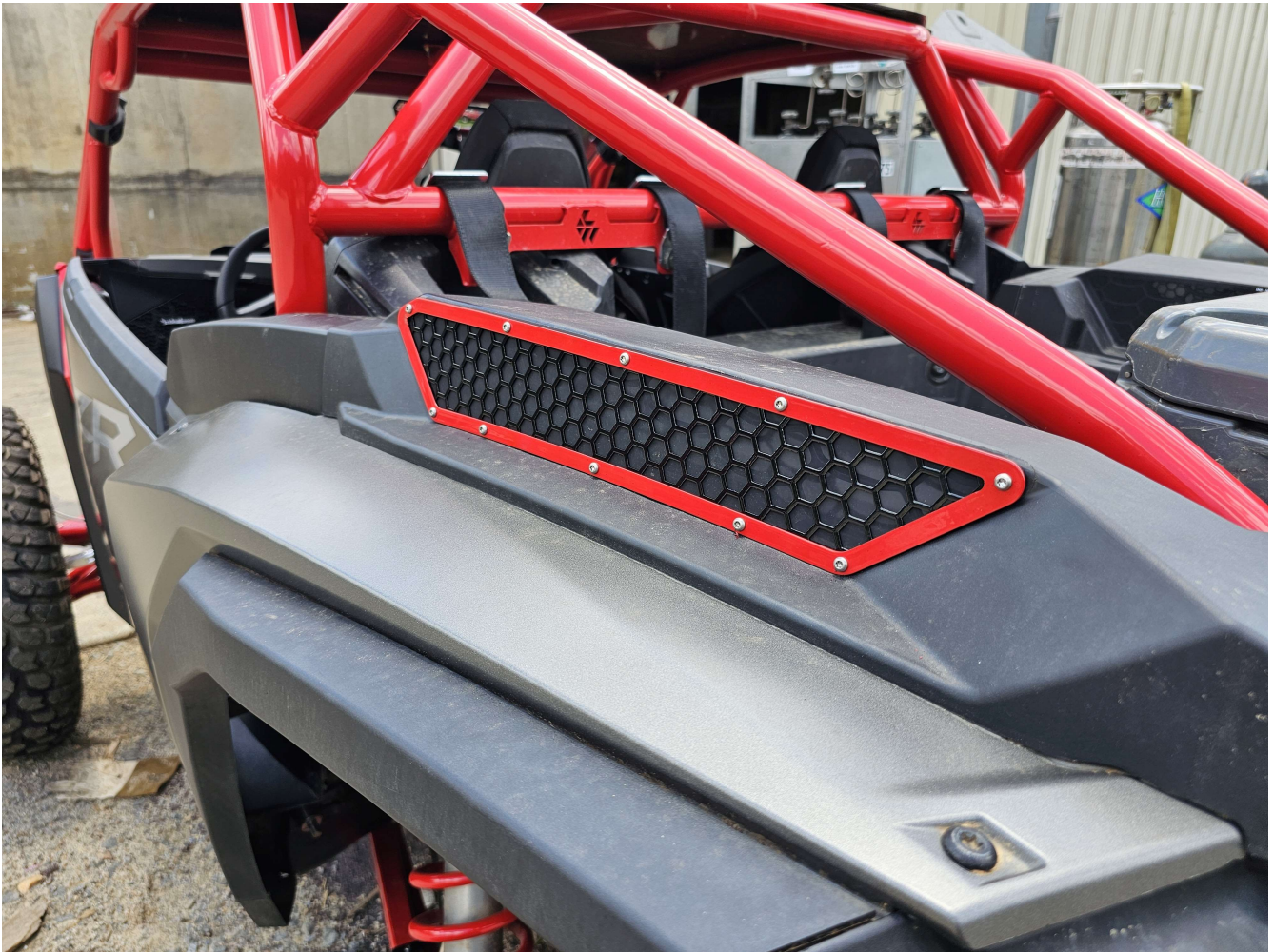
Outside Vent Cover installed