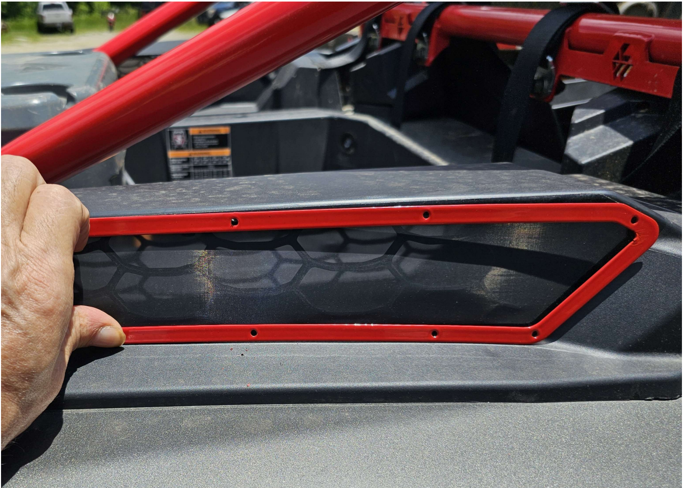
Vent Cover Outline held in place by hand for initial couple of holes