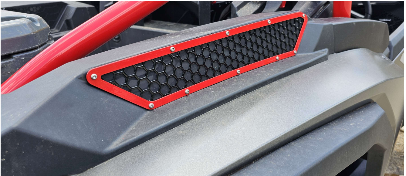
Vent Cover Outline and Mesh completely installed